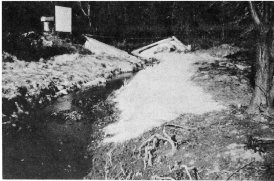
Figure 6. Gaging Station Above Pond